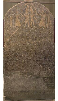
Figure 1: Israel Stele, dated 1208 BC mentions Israel by name.

Truth: While it's true that the nation was re-declared Israel in 1948, Jews have never abandoned Israel. Jewish people have always been present in Israel. Jewish history itself is rooted in Israel, even after the burning of the temple in 70 AD. There was a famous Bar Kokhba revolt in 132 AD. The books of Talmud Jerusalem were composed and compiled between 600 AD-1600 AD, these books were written in the land of Israel.